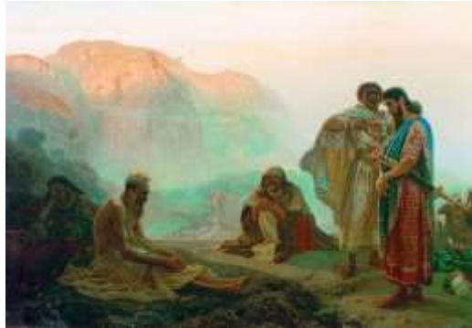
Eliphaz, Bildad and Zophar (Job three friends )