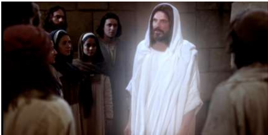
Jesus Christ appears to Mary Magdalene after resurrection